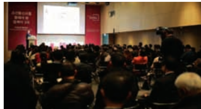
China Lecture Series