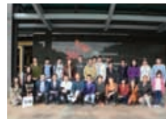
Visit to Industrial Site