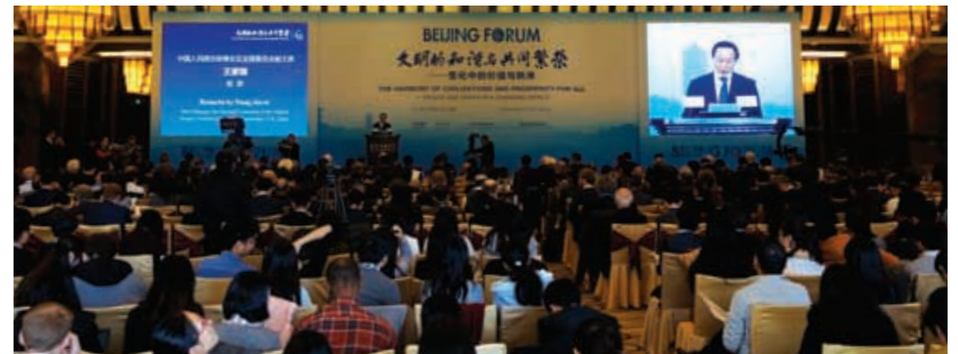
2017 Beijing Forum

KFAS and Renmin University of China have agreed to host the International Forum on Confucianism and the Law Forum biennially from 2015 onwards and the first Law Forum celebrating the 800th anniversary of the Magna Carta was held on September 5 to 6, 2015, at Renmin University under the overarching theme, “the Past, Present and Future of the Rule of Law.” The International Forum on Confucianism was held on December 2 to 3, 2016 under the theme, “Family, State, and Kingdom in the Horizon of Confucianism”, followed by the Law Forum on “Culture, the Rule of Law and Social Development” on November 18 to 19, 2017.