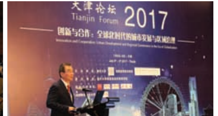
2017 Tianjin Forum