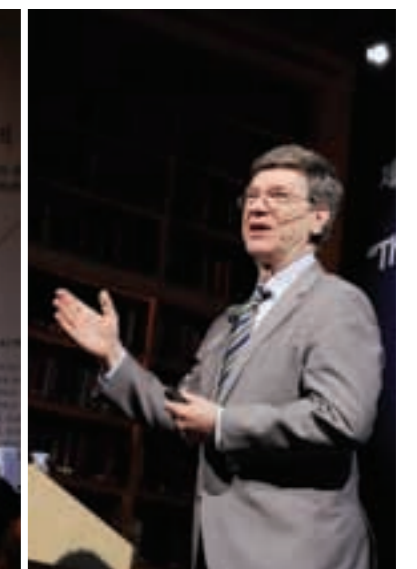
Special Lecture by Prof. Jeffrey D. Sachs