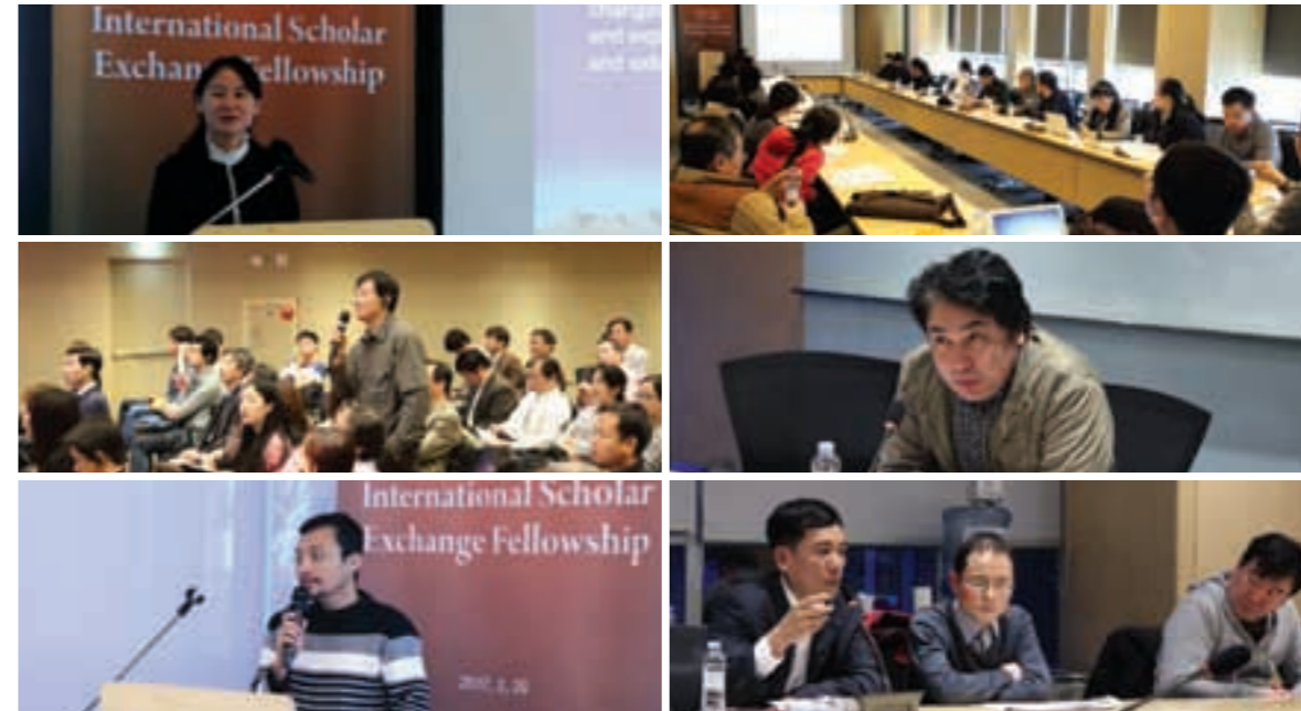
Academic seminars by ISEF fellows

dations. You may download the form at the KFAS homepage. (“Community”→“Download”→“Letter of Recommendation.doc”)