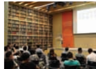
Korean Language Presentation