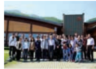
Visit to Afforestation Plant