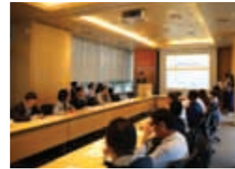
Orientation for the ISEF Fellows