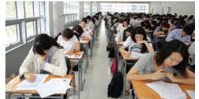
Scholarship Program Exam