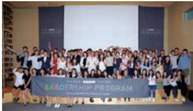
Korea-China LEADership Program