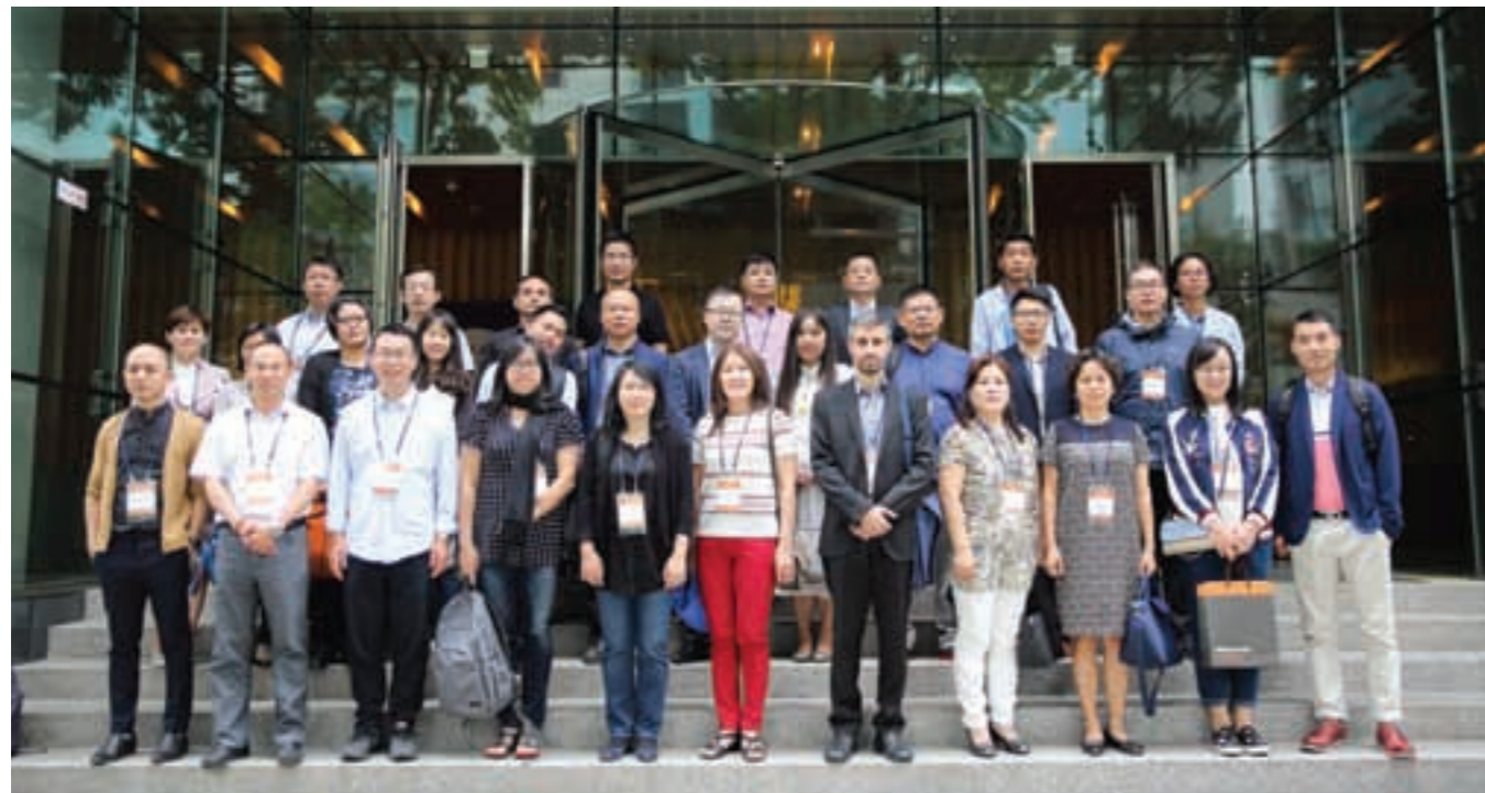
Arrival of 2017-2018 ISEF Fellows, in front of KFAS headquarters.

The ISEF program provides outstanding scholars with comprehensive research expenses during their stay in Korea, which include round-trip airfare, initial settlement support, a monthly research stipend, research paper publication support, and accident insurance. During their stay in Korea, fellows enjoy full access to KFAS facilities including the seminar rooms and library to help their research.