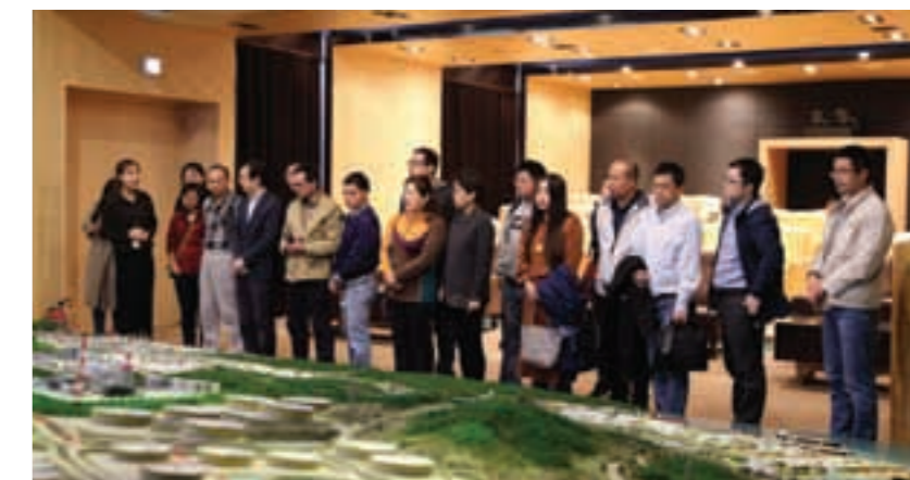
SK Energy Ulsan Complex Visit