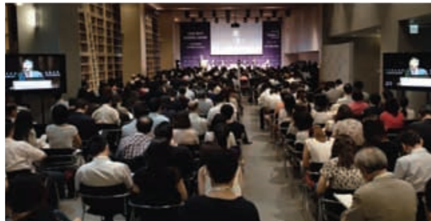
KFAS Conference Hall