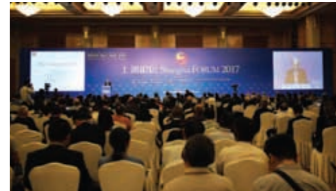
2017 Shanghai Forum

Forum with the Asia Media Research Center of Communication University of China to discuss the latest research in the fields of journalism, communication, media, new technologies, digital content, and related policies.