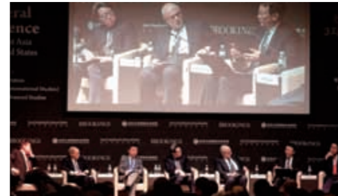
China-US-ROK Trilateral Conference