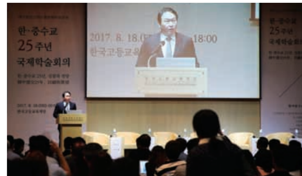
International Conference Commemoration 25 Years of Korea-China Diplomatic Relations