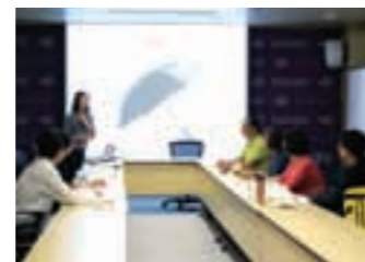
Korean Language Class