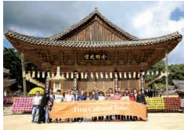
First Cultural Tour for 2017-2018 ISEF Fellows

Fellows are required to submit progress reports on the proposed research project on November 15, 2018 and February 15 and May 15, 2019.