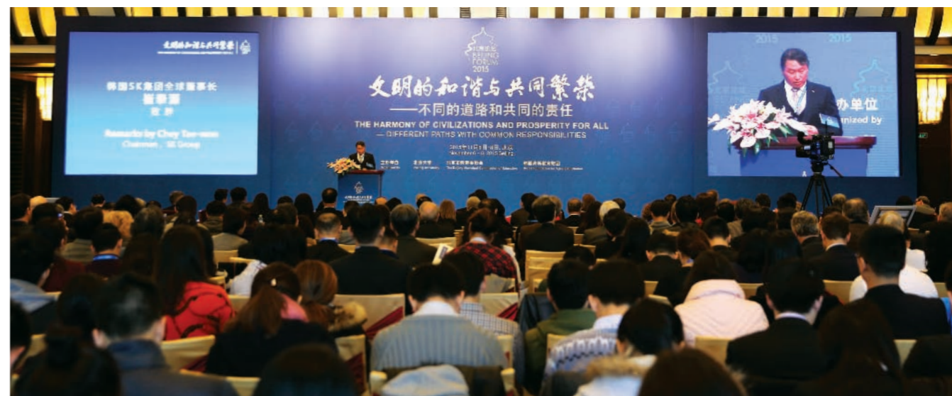
2015 Beijing Forum

The International Conference on Southeast Asian Cultural Values has been co-hosted annually by KFAS and the Royal Academy of Cambodia (RAC) since 2005. Over the years, the conference has focused on the following critical themes: “Preservation and Promotion of Culture” (2005), “Exchange and Cooperation” (2006), “Pro-