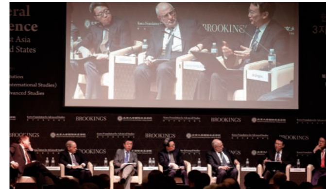
China-US-ROK Trilateral Conference

From 2013 to 2015, KFAS invited eighteen leading Korean experts on China to KFAS headquarters to give monthly lectures as part of the China Lecture Series . Lectures were given on various top-