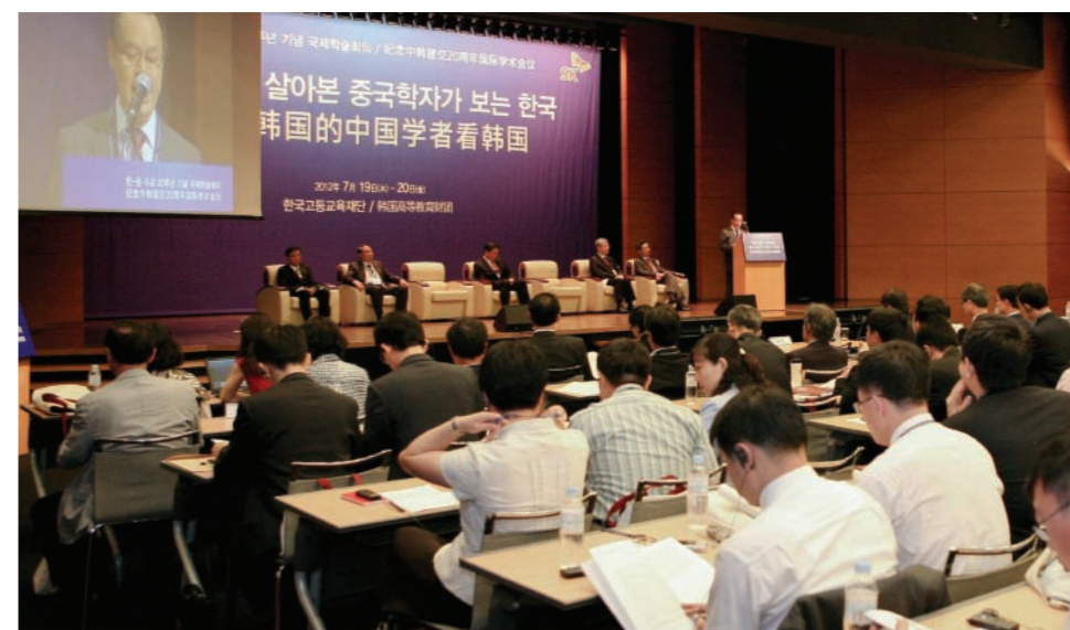
International Conference Commemorating 20 Years of Korea-China Diplomatic Relations