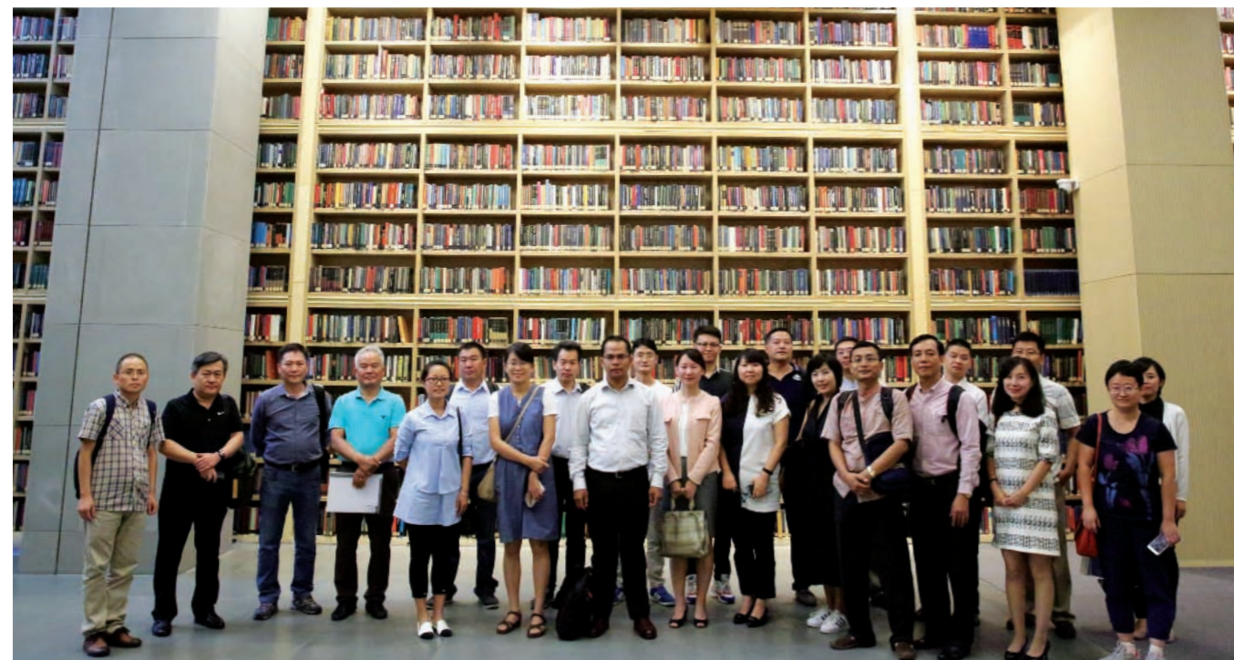
2016-2017 ISEF Fellows in the Conference Hall, upon arrival at KFAS

KFAS invites prominent scholars from Asia and the Middle