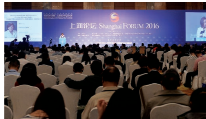
2016 Shanghai Forum