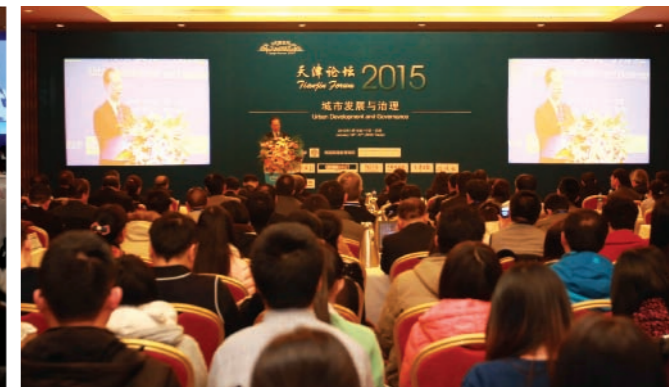
2015 Tianjin Forum

KFAS and Yanbian University began co-hosting the Tumen River Forum in 2008, inviting scholars and experts from China, South Korea, North Korea, Japan, Russia, and the United States to discuss regional issues such as the development of the Tumen River area. The overarching theme of the forum is “Multicultural Coexistence and Win-win Cooperation.”