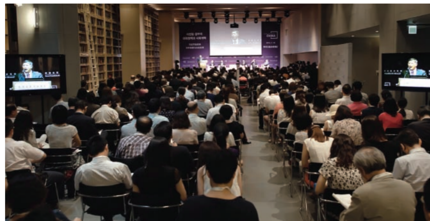
KFAS Conference Hall

project in an academic context by referencing major works by other scholars in this field. A selected bibliography may be attached in order to specify the background of your proposed project. Also describe how your proposed research plan is related to your previous study/research, and fits your future academic goals.