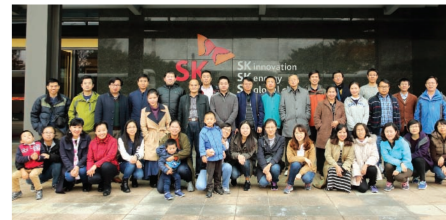
SK Energy Ulsan Complex Visit