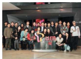
Visit to Industrial Site