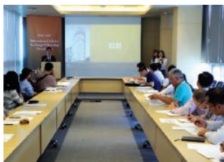
Orientation for the ISEF Fellows