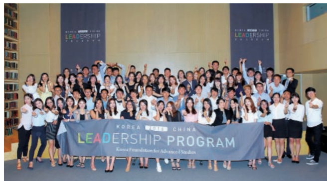
Korea-China LEADership Program

alumni who are prominent university professors and researchers have volunteered their services as of now.