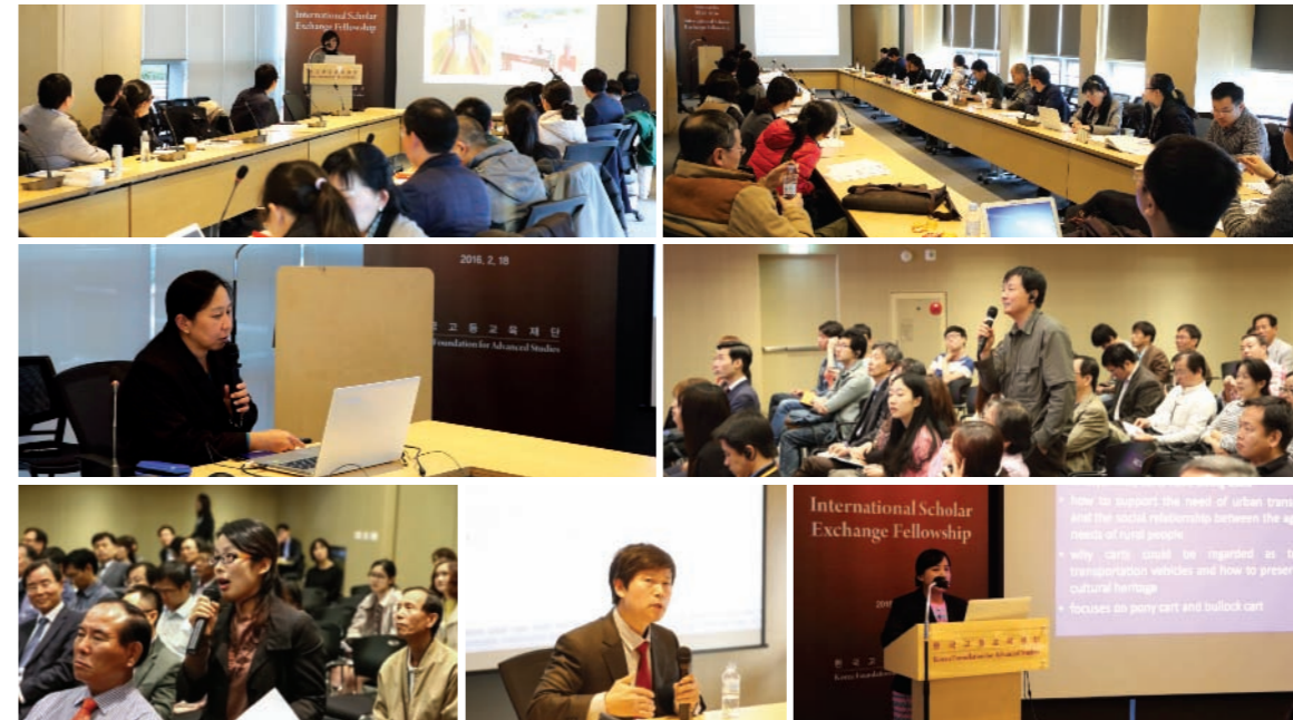
Academic seminars by ISEF fellows

dations. You may download the form at the KFAS homepage. (“Community” → “Download” → “Letter of Recommendation.doc”)