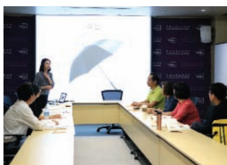
Korean Language Class