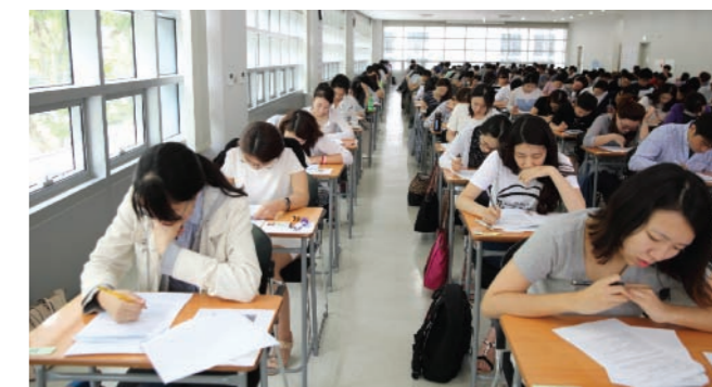
Scholarship Program Exam