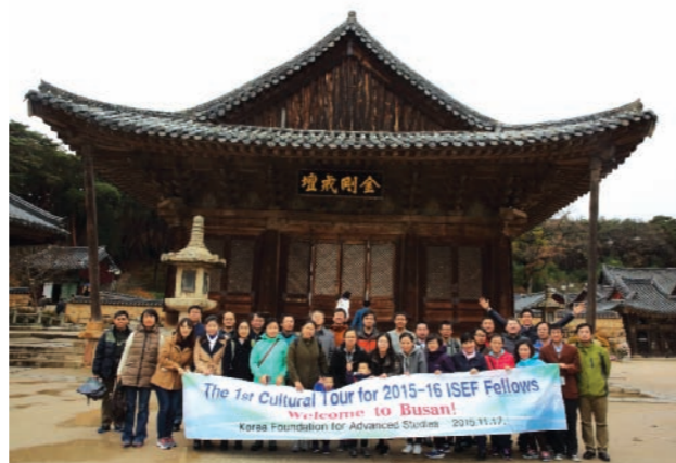
First Cultural Tour for 2015-2016 ISEF Fellows

•VIETNAM Vietnam National University, Hanoi Asia Research Center Room No. 504, 5th Fl., Headquarter Bld. 144 Xuan Thuy Rd., Cau Giay District Hanoi, Vietnam T. 844-37547987 E. arc@vnu.edu.vn