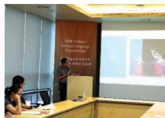
Korean Language Presentation