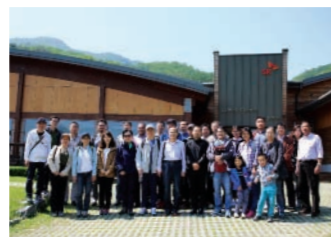
Visit to Afforestation Plant