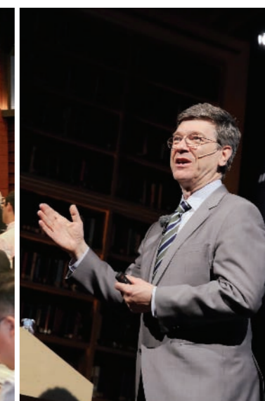
Special Lecture by Prof. Jeffrey D. Sachs