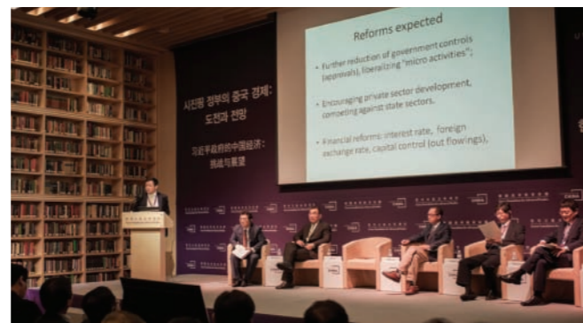
Understanding China Conference